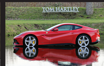
14 FERRARI F12BERLINETTA Rosso Corsa With Crema Hide 8,000m £194,950