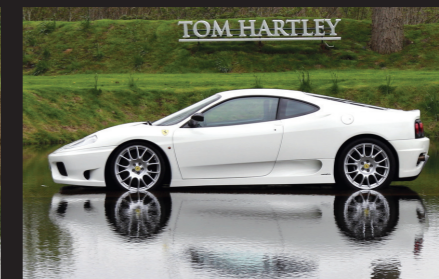
04 FERRARI CHALLENGE STRADALE F1 Bianco Avus With Blue Alcantara 12,000m £159,950