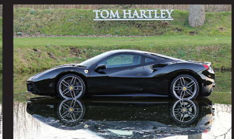
66 FERRARI 488 GTB Nero Daytona Metallic With Nero Hide 6,000m £174,950