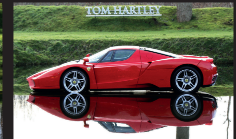
04 FERRARI ENZO (CLASSICHE CERTIFIED) Rosso Corsa With Rosso Full Leather 4,000m £1,895,000