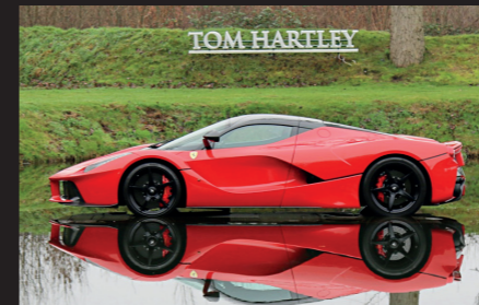
63 FERRARI LAFERRARI COUPÉ Rosso Corsa With Nero Alcantara 6,000m £2,100,000

THE ULTIMATE NAME DEALING IN LUXURY, PERFORMANCE & CLASSIC CARS