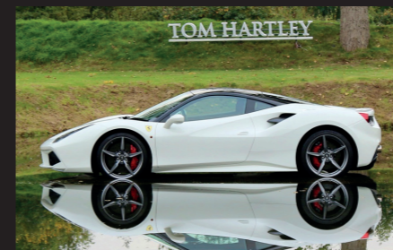
16 FERRARI 488 GTB Bianco Avus With Nero & Rosso Hide 4,000m £179,950