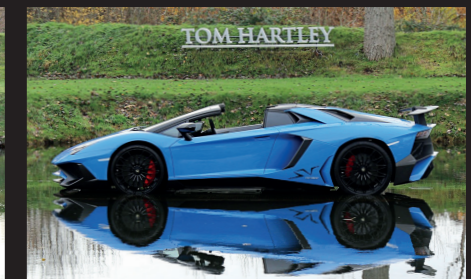
16 LAMBORGHINI AVENTADOR LP 750-4 SV ROADSTER Ad Personam Le Mans Blue With Nero & Rosso Alala Alcantara 2,000m £349,950