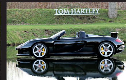
04 PORSCHE CARRERA GT Basalt Black With Black Leather 6,000m £625,000