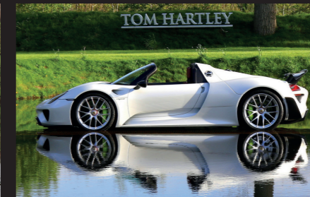
14 PORSCHE 918 SPYDER WEISSACH PACKAGE Colour To Sample Pearlescent White With Garnet Red Leather 6,000m £1,195,000