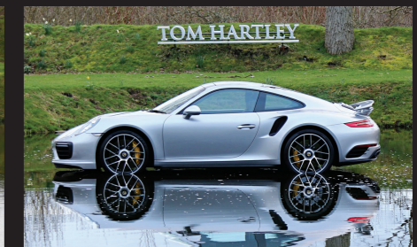
65 PORSCHE 911 TURBO S (991) GEN II GT Silver Metallic With Black Leather 14,000m £116,950