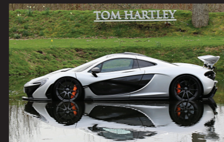
64 McLAREN P1 VAT QUALIFYING Supernova Silver With Carbon Black Alcantara 5,600m £1,100,000