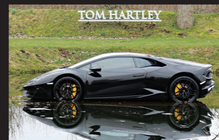
17 LAMBORGHINI HURACAN LP 580-2 RWD COUPÉ Nero Helene With Nero Ade & Giallo Taurus Sportivo Alcantara 15,000m £144,950